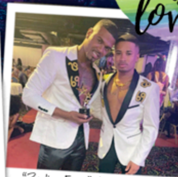
"Zodiac Face" $1000 Winner Legendary Cash GG House of Gorgeous Gucci