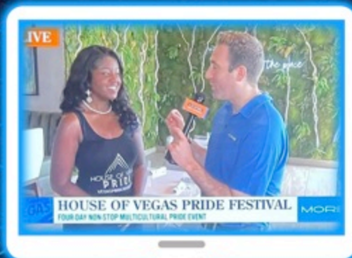
HOUSE OF VEGAS PRIDE FESTIVAL FOUR DAY NON-STOP MULTICULTURAL PRIDE EVENT