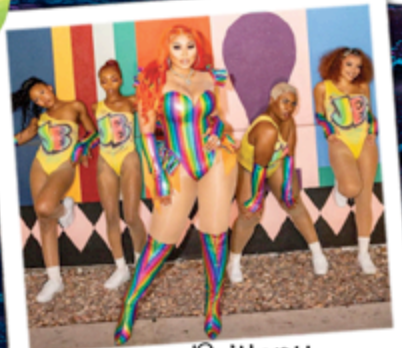
Just Brittany House of Frequency Music Festival