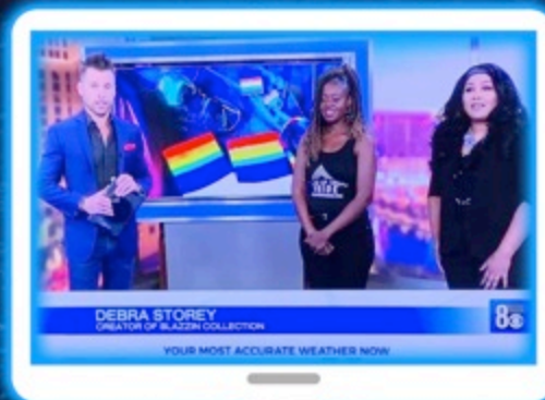
DEBRA STOREY CREATOR OF BLAZEN COLLECTION