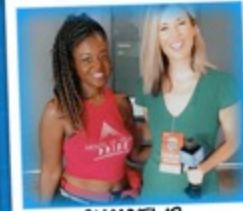
CHANNEL 13 Interview at Las Vegas Aviators Pride Night Baseball Game