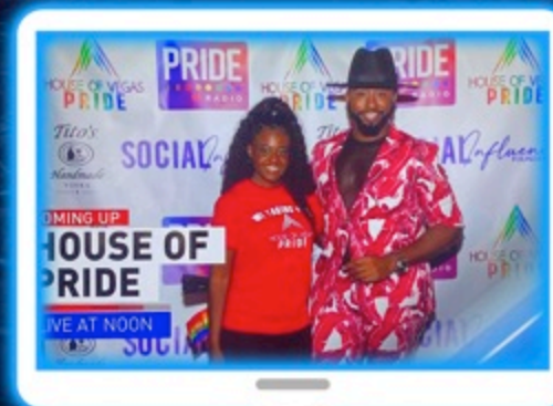
COMING UP HOUSE OF PRIDE LIVE AT NOON